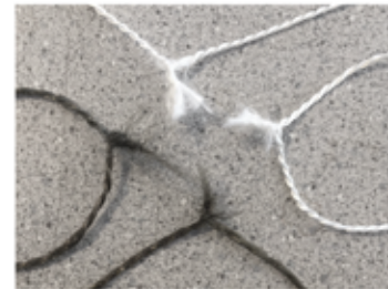
Nylon & Polyester

Dense Polymer Construction Heavy metal parts & bad seals are a thing of the past through the use of our durable polymer construction. Using industrial 3D printing technology, our simplistic design minimizes moving parts for a better splice.